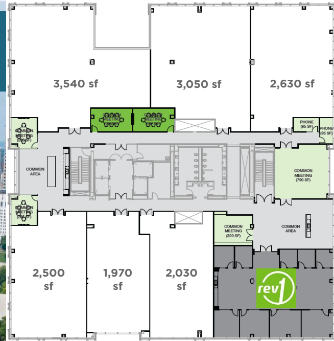
330 Rush Alley in The Peninsula Development