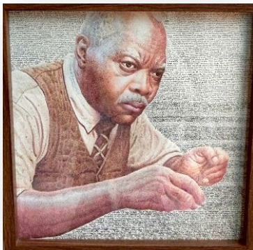
Granville T. Woods